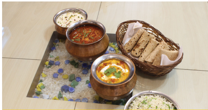
Veg. and Non-veg. meals.