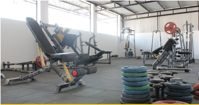
Equipped with Gym